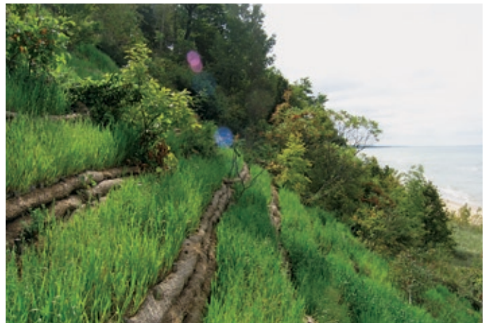
Within weeks of the project's completion, the native seed mix was returning the bluff to a natural vegetated condition.

After prepping the upper portion of the slope, the crew seeded the area and installed the C-TRM overtop. They then tiered the remainder of the slope every 8 to 10 feet, creating 4- to 5-foot-wide benches. The SedimentSTOP rolls were used to help create the tiered benches, as well as to protect the edges of the tiers while the turf reinforcement mat was installed on the top face of the tiered benches. The Lake Michigan bluff project—originally