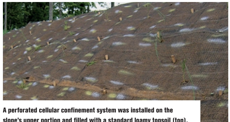
A perforated cellular confinement system was installed on the slope's upper portion and filled with a standard loamy topsoil (top). The area was then seeded and protected with a coconut-filled turf reinforcement mat (bottom).