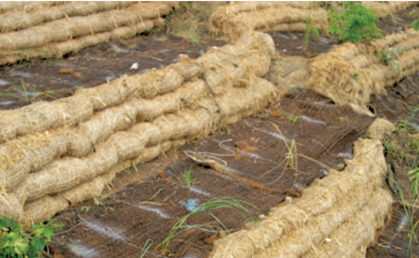
Rolled sediment filtration devices and turf-reinforcement mats were used to build and stabilize the terraces.

After prepping the upper portion of the slope, the crew seeded the area and installed the C-TRM overtop. They then tiered the remainder of the slope every 8 to 10 feet, creating 4- to 5-foot-wide benches. The SedimentSTOP rolls were used to help create the tiered benches, as well as to protect the edges of the tiers while the turf reinforcement mat was installed on the top face of the tiered benches. The Lake Michigan bluff project—originally