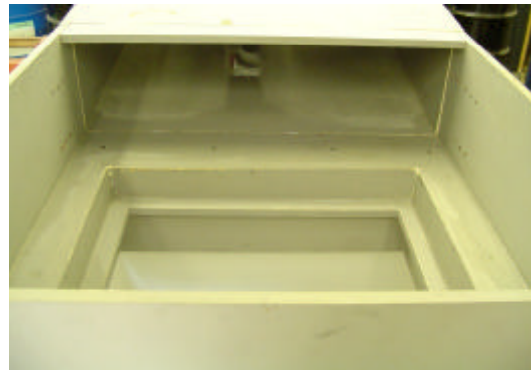
Drain Inlet - Pre Test