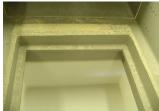
Drain Inlet - Post Test